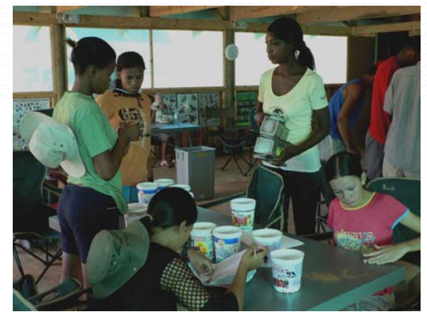
Patience helping learners with identification of trapped species

This past year, filled with many challenges, has proven how dynamic our programme, staff and even our buildings can be.