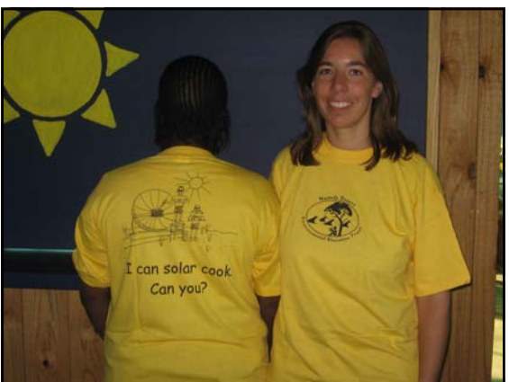
NaDEET staff displaying new shirts

We have created a colorful poster to share information about NaDEET's activities and location. Our primary goal is to use the poster to introduce and remind Namibians of NaDEET. We have produced a matching brochure mainly intended to better explain NaDEET to donors and supporters. The brochure can be downloaded from our website in German and French.