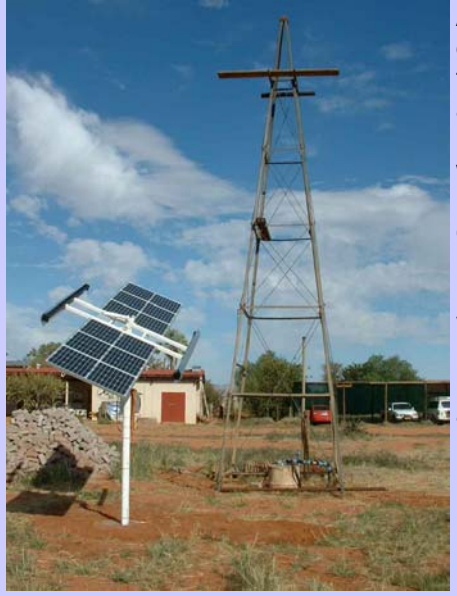
Solar water pump at NaDEET's base

In addition, we made several major improvements to NaDEET Centre and our office and accommodation base. Due to increases in average visiting group size, we built an additional two room staff house and a staff/ visiting teacher shower at NaDEET Centre. The large teacher house was then converted into another house for learners. We now have six large accommodation units for learners and three small accommodation units for accompanying adults. We have also purchased a good quality digital camera to properly document our environmental education activities. Early last year we upgraded our radio communication system with the purchase and installation of three base stations for NaDEET Centre, our office and our vehicle. Our previous hand-held radios were not strong enough to send and/or receive signals in the dune valley. This purchase helped us tremendously to get quick assistance on the day of the fire.