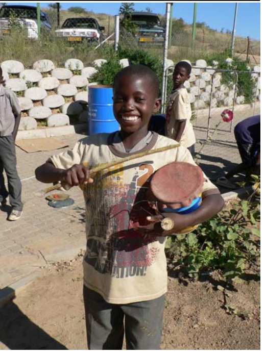
Learners at Dr. Frans Indongo Primary School came up with many of their own recycling project ideas. This learner made his own drum with a rattle out of an old tin of peaches, tyre tubing, wire, bottle cap and a stick.

For this coming year, we have received funding for one issue so far to celebrate World Water Day from the Wetlands Working Group in Namibia via the Small Grants Project. We have already applied for funding for an issue on Wilderness Areas in Namibia and hope to receive a positive response soon. The concept of the wilderness issue was developed by the Game Rangers Association of Africa meeting at NaDEET last year.