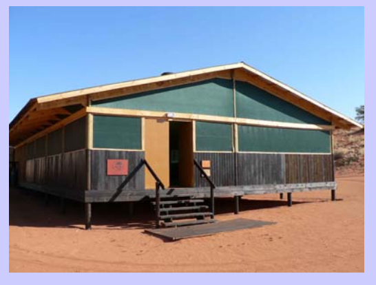
The new classroom's entrance

26 Aug: Official re-opening of NaDEET Centre