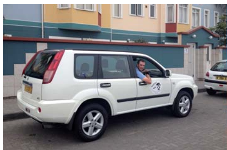
Trust-worthy transport on Namibia's long, dusty gravel roads is essential to good project management.

After having used our 4x4 and 2x4 vehicles for about 11 years the long and rough roads of the south have taken its toll. These vehicles are still in 'ok' shape however a decision was made to reduce them from travelling very long distances. NaDEET was in desperate need of purchasing a new vehicle to transport mainly people to and through. We did not want to spend a lot and the type of vehicle needed to be sturdy enough for the roads in the south. New vehicles were looked at but with insurance costs high and some unexperienced drivers we were reluctant to get a new vehicle. I test drove several second hand vehicle and was amazed of how much money was asked for very run down cars. After several unsuccessful fundraising attempts and browsing the second hand market for some time, an opportunity came along to purchase a second hand vehicle with very low kilometres for a good price. In the end we had to bite the bullet and pay the vehicle out of our general funds. Andreas Keding