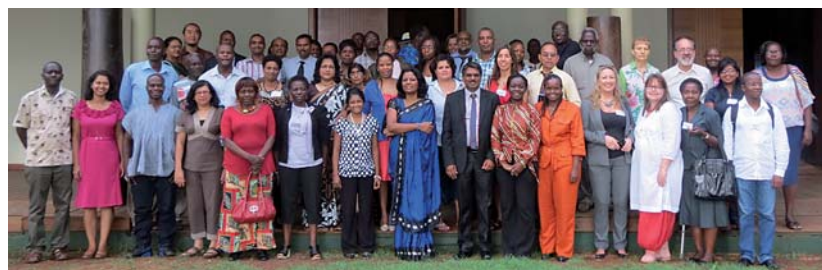
82 experts including practitioners, academics and policy makers from 25 countries from all regions of the African continent

The three day meeting was held on the island of Mauritius as it is one of four countries worldwide that is currently implementing a pilot climate change education programme with UNESCO. Acutely aware of the impacts of climate change, this island nation was an appropriate host for this Africa-wide meeting. Climate change education is on the agenda of most countries and many are trying to incorporate it into existing environmental education activities. The meeting concluded with recommendations for further Education for Sustainable Development (ESD) practices related to climate change education.