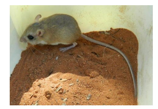
Fig: 3 G. paeba