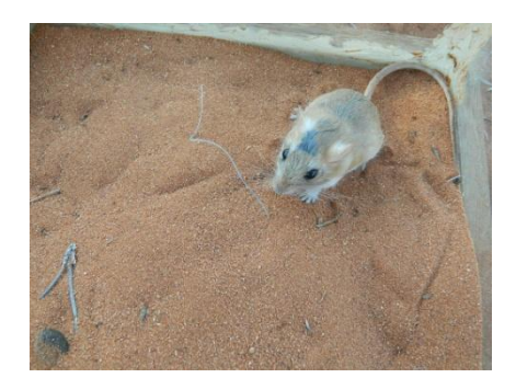
Fig: 4 G. Tytonis