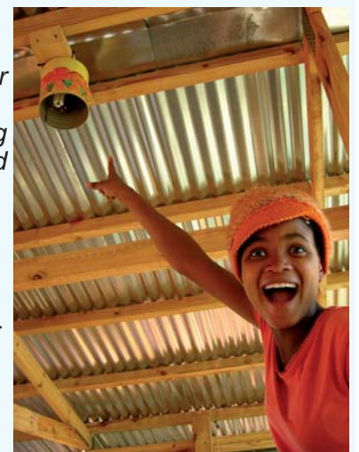
The new houses all have recycled art light covers made by learners

"WOW... the stars are so bright and clear here! I'm definitely going to go home and make some covers for the lights at my house." exclaimed a school learner from Empelheim Junior Secondary School.