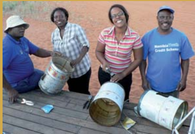
Building Fuel Efficient Stoves

Fifteen members of the Directorate of Youth took part in a “train the trainers” week at NaDEET Centre from 21-25 May 2012. The programme covered current environmental problems and solutions, educational methods, activity and programme development, and included a session on support material development to enable the participants to improve the quality and content of the environmental education activities they offer to youth nation-wide. A session on “greening” youth centres in all their aspects through infusing sustainable living practices also formed part of the programme.