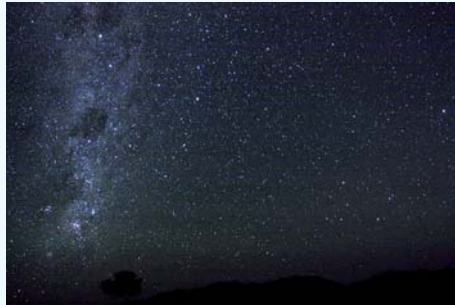
NaDEET's sky

What is the thing I will miss the most about this place? The night sky. Since the first night I spent here I have been astonished by the beauty of the outstanding sky. I found it impossible to describe to my friends and relatives so I ended up using an image. I told them to imagine a huge dark blanket; an old blanket, with millions of holes in it through which light escapes – the stars.