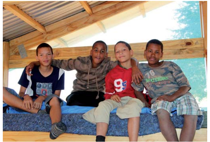
Boys relaxing on the new bunk beds

As previously reported the building of the first three houses took place during February 2012, while the second three houses, two teacher houses and additional teacher bathroom and urine diversion system (UDS) toilet were built in May. Four NaDEET staff plus five casual workers were part of the building team who worked hard and efficiently to ensure the Centre was closed for groups for the shortest time possible. The houses are still 5m x 5m in size, however with the higher walls and new roof structure, they effectively have more space than the previous A-frame type house. With new bunk beds and firm mattresses, the facilities are appropriate for all ages and give all participants a good night's rest. For accompanying teachers, bus drivers and other visitors during our school programmes, the "teachers' houses" are in the same design as the participants' houses. To provide