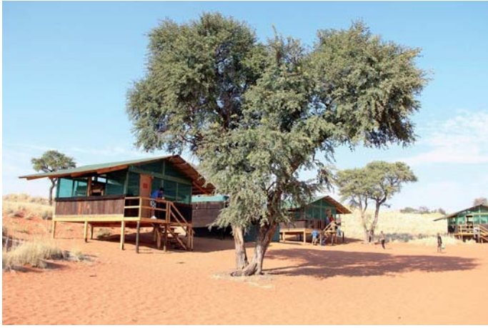
Schoolchildren enjoying new houses

Thanks to ongoing support from Rotary Club Windhoek and a generous grant from the Embassy of the Federal Republic of Germany in Windhoek, we can happily report the NaDEET Centre accommodation renovation is complete ahead of schedule!