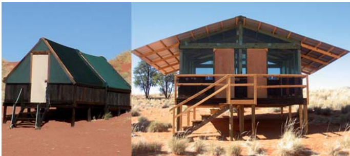
Old and new "teachers' houses"