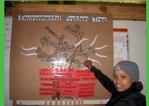
Through the "Environmental Problem Tree" the learners explore and learn about the causes and the consequences of environmental problems and look for possible solutions.

To assess improved learning and critical thinking skills, our programme has built continuous assessment into the activities as illustrated in the "Prioritise Your Pyramid" game. Another example is an interactive game entitled "Consumer Survey" which asks learners their attitudes towards the environment and lifestyle choice. Some of the questions include "Do you recycle? Do you think you are part of the environment or do you think humans could survive without it? Do you prefer to drive in a car to school or take public transport?". The consequences of different lifestyle choices are learned and discussed throughout the programme. Learners write a letter to themselves about what they intend to do differently when they return home which we send to them three months later. We are grateful to the NNF-Nedbank Go Green Fund for supporting environmental education for secondary school learners in the Hardap region. As future leaders of the country, they are a valuable resource for Namibia's sustainable development.