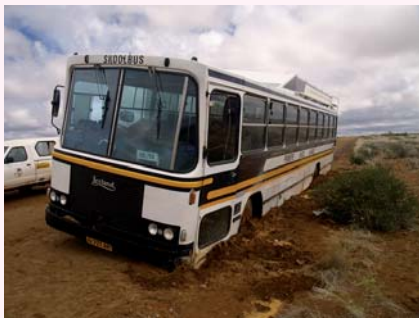
The bus stuck in the mud

"Our bus is stuck in the mud can you help?" is the teacher's cry for assistance as NaDEET staff wait for the children's arrival. Groups coming to NaDEET