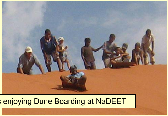
Danie Joubert P.S. Girls and Boys classes enjoying Dune Boarding at NaDEET