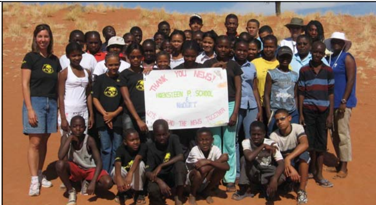
Hoeksteen Primary School at NaDEET

In June, NaDEET, in conjunction with the Namibian Environment and Wildlife Society (NEWS), sponsored an essay contest among Southern Namibian schools. Learners were asked to explore the topic: "Apathy and the Environment". Students in the Hardap and Karas regions were challenged to write about their local environments and communities. How do their local communities act towards the environment — are they concerned and respectful or do they show little or no interest and concern? We received entries from 11 different schools. Each participant received a Certificate of Participation. The first prize was an all expenses paid visit for the learner's class to NaDEET Centre.