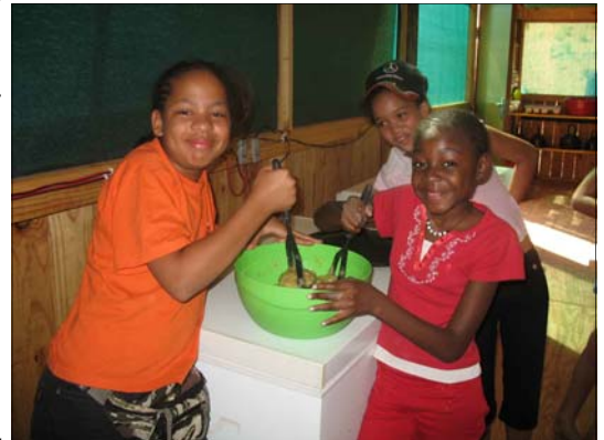
DHPS grade six learners preparing muffins for the solar oven.

Our last new visitors to NaDEET are from a small farm school North-east of the Naukluft Mountains, Witkrans Primary School. The school principal, teacher and secretary together with all thirty of the school's learners came to NaDEET in July.